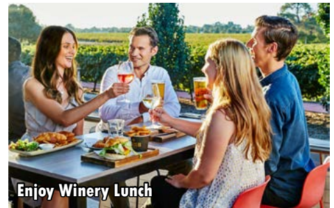
Enjoy Winery Lunch