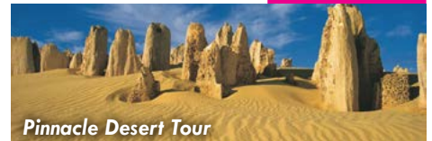
Pinnacle Desert Tour